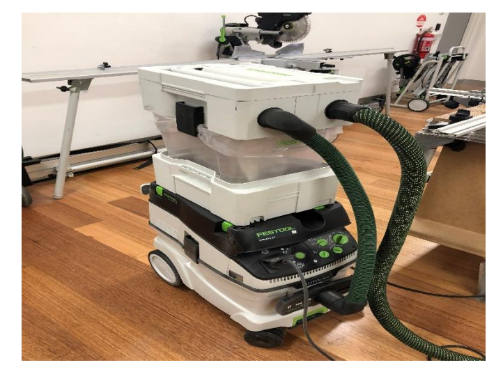
The CTM 36 AutoClean Dust Extractor with the pre-separator cyclone unit attached. This extraction setup was used in samples M3288/1,2,5 and 6.