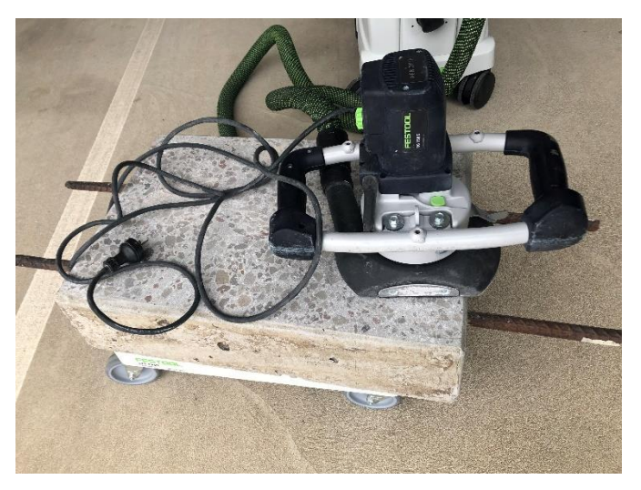
The Festool RG 150 E grinder used to grind concrete in sample M3288/5. Results from this sample were well below the relevant exposure standards.