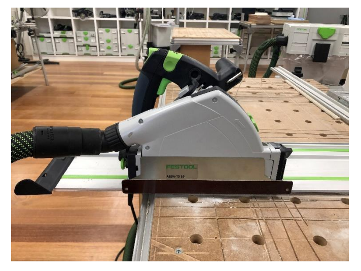
The Festool TS 55 Plunge Cut saw with dust guard. This unit was used in samples M3288/1 and 6.

The CTM 36 AutoClean Dust Extractor with the pre-separator unit not attached. This extraction setup was used in samples M3288/3 and 4.