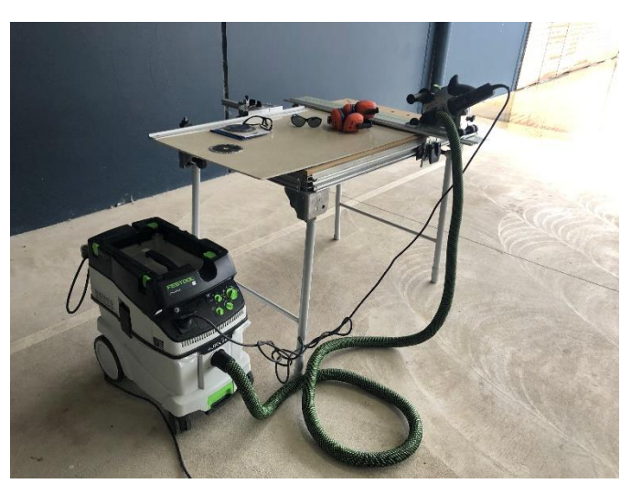
The external sampling setup for sample M3288/3. The Diamond Cutting angle grinder system is seen attached to the extractor with no –pre-separator attached.