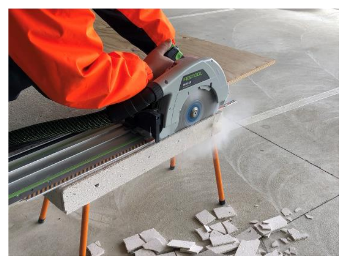
The HK 85EB circular saw cutting the Hebel product (Sample no. M3288/2). This was the only sample to return detectable results for RCS and also produce the highest total respirable dust results.