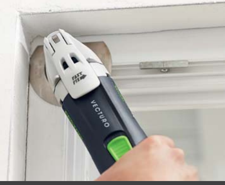
Right up to the edge: with the saw blade with depressed centre.