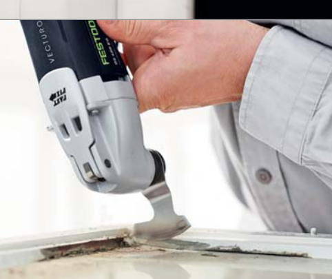
The special blade for window installation for removing putty from window panes.