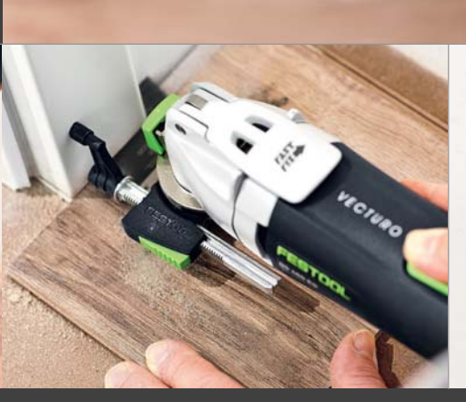
For plunge cuts to a specific depth: the depth stop, which attaches quickly with no tools required.