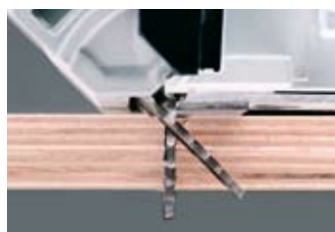
The scribe line is the same as the cutting edge, even when performing angled cuts.