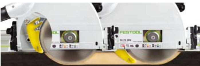
Retracted riving knife for plunge-cutting.