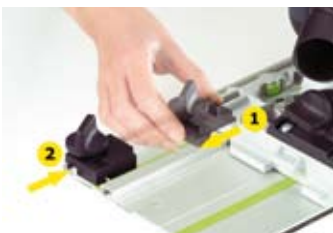
Simply pull the return stop out of the depot and put it onto the guide rail.

The return stop on the TS 75 performs two tasks at once: when fitted onto the guide rail, it prevents kick-back during plunge-cutting and it holds it in the set position. This ensures pinpoint accuracy when plunge-cutting.