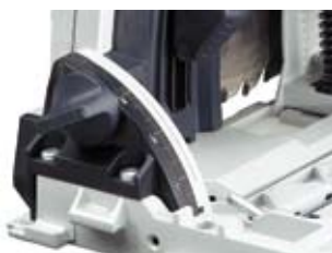
Angled cuts can be set and read precisely with the cutting indicator.

Here, the scribe line is always the same as the cutting edge, even when cutting bevels. And this can be set accurately from 0° to 47° on the easy-to-read scale.