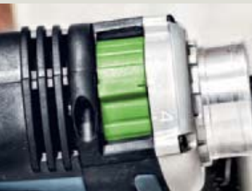
4-speed gearing. So speed and power can be adjusted to suit any