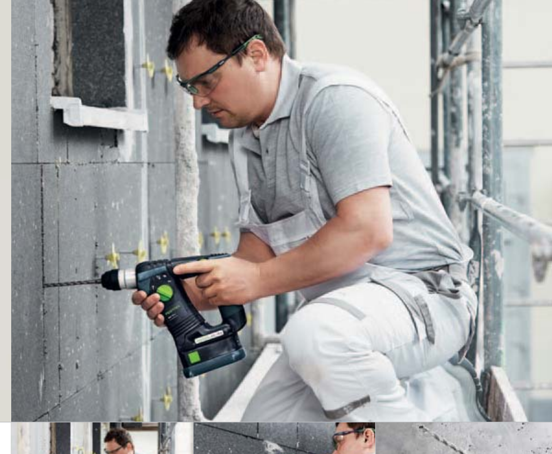
The BHC 18 has the best weight/power ratio in its class.

Package contents Lorder numbers from page 26