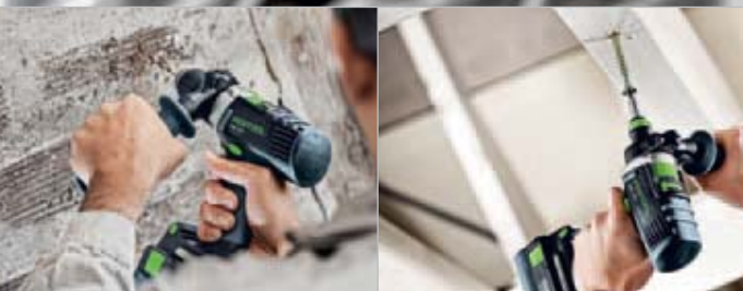
Speed: 3,800 rpm in 4th gear. The QUADRIVE operates at the ideal drilling speed, allowing you to work quickly, efficiently and accurately.

Package contents Lorder numbers from page 24