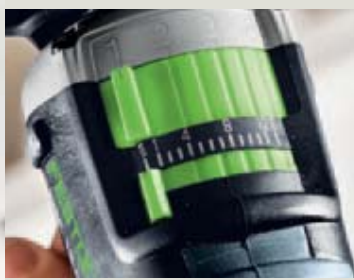
So speed and power can be adjusted to suit any work