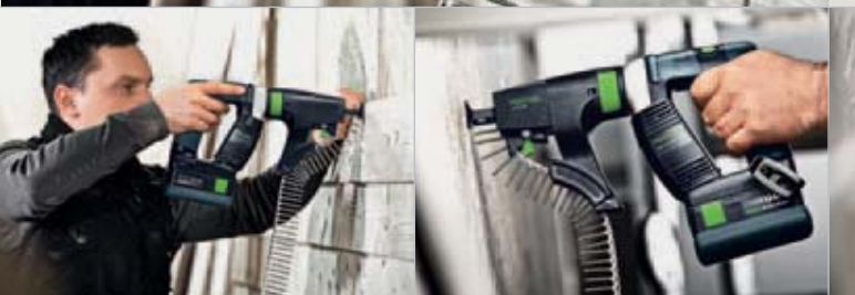
Giving you a hand: with the magazine attachment, you have one hand completely free, for example to press plasterboard panels into position or when working on ceilings.

Package contents | order numbers from page 27