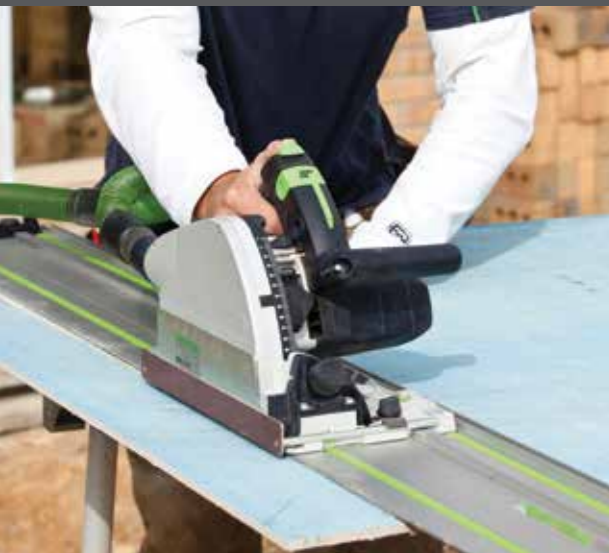
Step 3: Complete your cut - quick and simple.