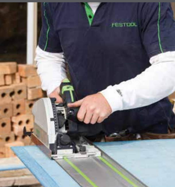
Step 2: Lay the guide rail on your scribe marks.