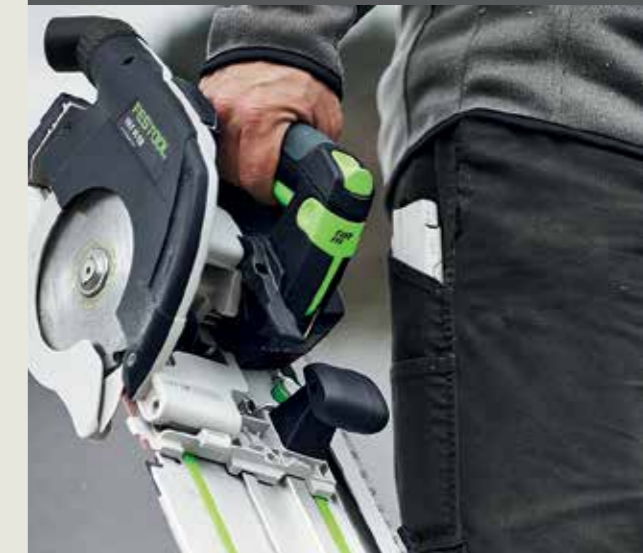
HK 55 - Ideal for linear boards and cement sheet with full dust extraction