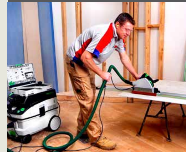
TS Plunge Saw - Available in 55mm or 75mm depth of cut. Ideal for continuous sheet products with full dust extraction.