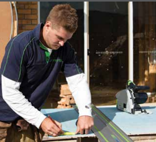
Step 1: Mark it out.

Festool's complete sawing system can be configured to cut a wide range of building materials - timber, particleboard, MDF, cement sheet products, even aluminium - quickly, accurately and without mess. Made in Germany to the highest quality standards, it's the only circular saw you'll need on site.