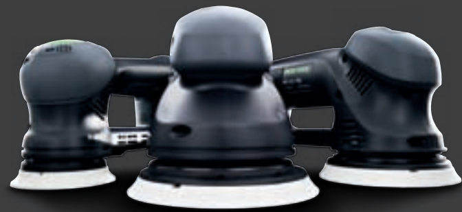
ROTEX RO 125 ROTEX RO 150 ROTEX RO 90 DX

An overview of the ROTEX range and main applications