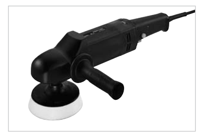
RAP 150 E 503/19