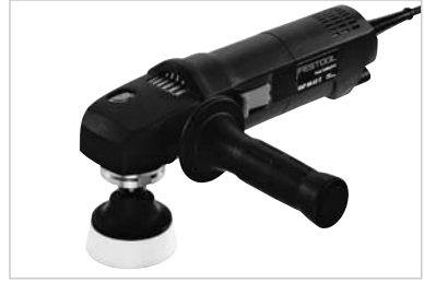
RAP 80 E 503/18