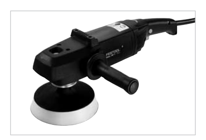
POLLUX 180 E 503/20